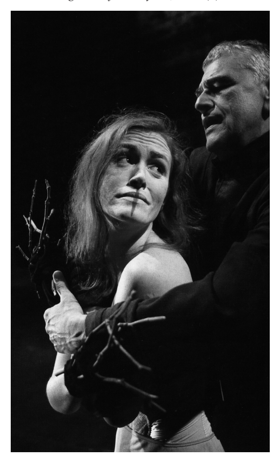
Figure 8: Julie Taymor, 1994 (2)