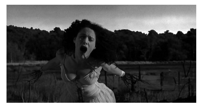
Figure 9: Julie Taymor, 1999 (1)