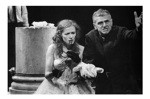
Figure 7: Julie Taymor, 1994 (1)