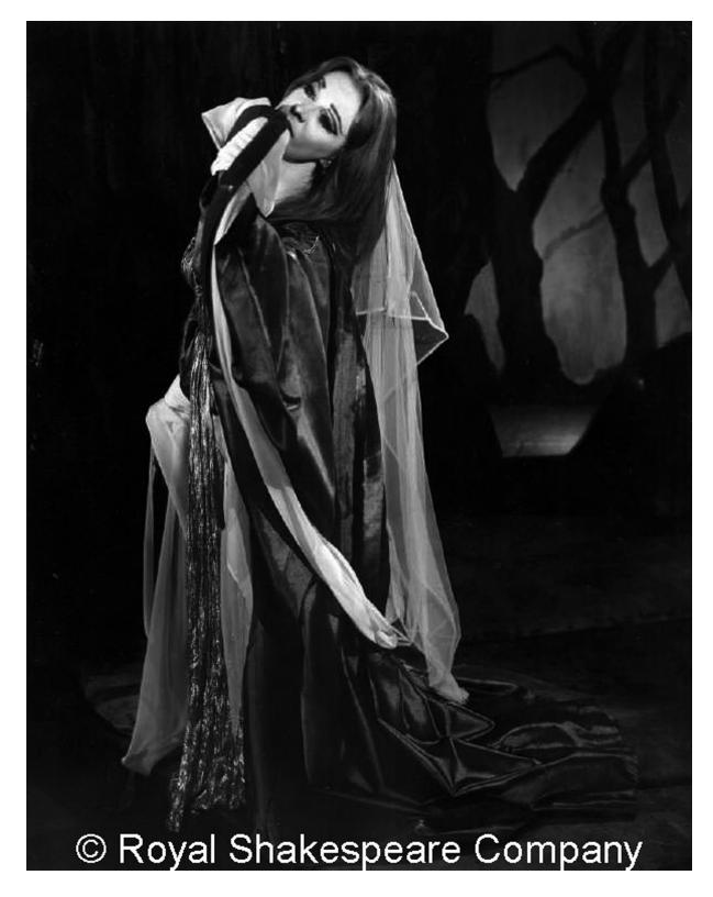
Figure 1: Peter Brook, 1955 (1)