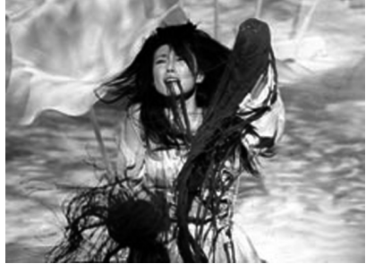
Figure 3: Yukio Ninagawa, 2006 (1)