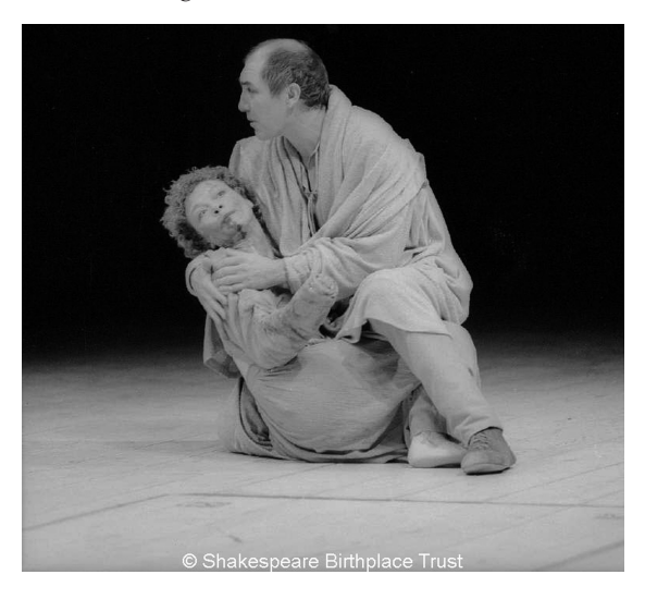
Figure 6: Deborah Warner, 1987