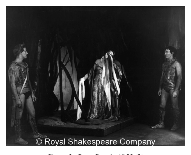
Figure 2: Peter Brook, 1955 (2)