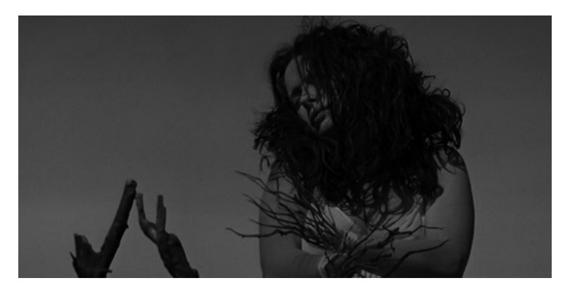
Figure 10: Julie Taymor, 1999 (2)

the ribbons streaming from Lavinia's wounds resemble the tree branches of the scenery in the background (cf. illustrations 7, 8, 9, 10 and 2).